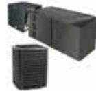
Furnace/ Air Conditioner